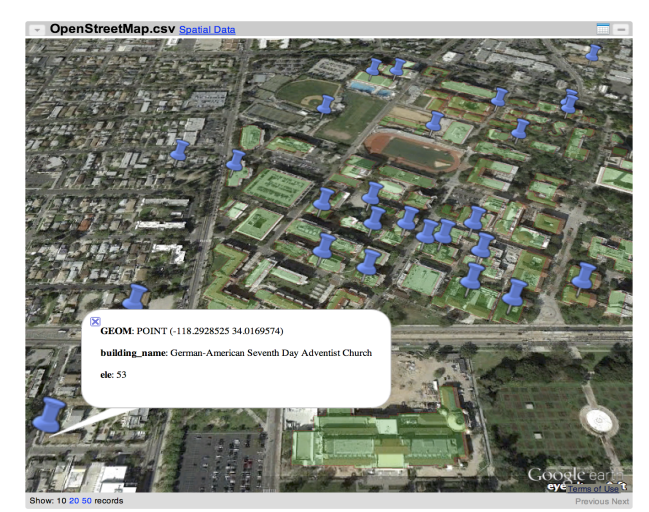
Figure 5. Display on Google Earth.

Figure 5 illustrates the extracted geographic information for the building scenario visualized on Google Earth with Karma. Each building, shown as a pin located at a place which can be found by the given values of latitude and longitude, is represented by "point" in the source data. The green polygons also denote buildings when they are described by "polygon" in the source. In Figure 5, the bubble, which appears when users click on pin or polygon, displays the details about that building.