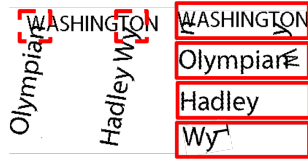
Figure 2. Splitting merged strings

string and identify individual strings. Finally, we identify two types of connected components as the splitting points: The first type is the connected components that have more than three links, such as ‘Ty’. The second type is the connected components that constitute an angle smaller than a threshold with the two neighbors, such as ‘Wn’ and its neighbors ‘a’ and ‘A’. We calculate the angle between three connected components using the centroid of each connected component. In the case where three connected components of the same height constitute a straight string, the angle is 180 degrees. However, since the connected components have various heights, we use an angle threshold of 145 degrees to prevent breaking a continuous string. For the maps with curved labels, we use an angle threshold of 125 degrees to preserve them. After we identify the splitting points, we can produce individual strings as shown on the right side of Figure 2.