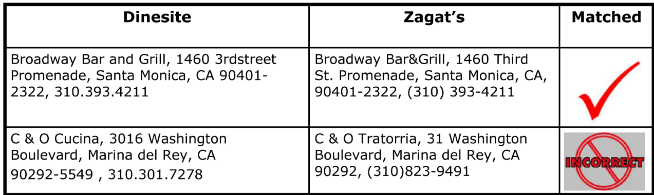
Figure 1: Textual Inconsistencies Across Data Sources

address the issue of user involvement. Using secondary sources, a system can autonomously answer questions posed by its active learning component. By diverting questions to the system itself, the entire record linkage process minimizes the involvement of a user. In the extended Apollo system, user involvement is limited to a preprocessing step used to evaluate secondary sources.